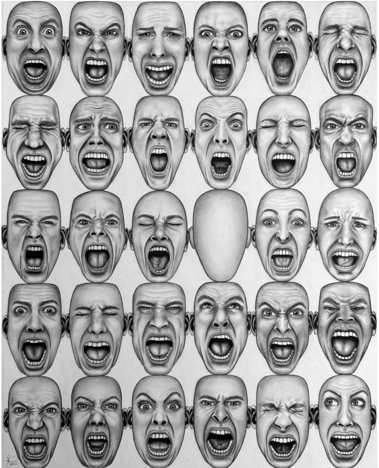
Title: you From the collection of "Shout" Dimension: 70 x 50 cm Medium: charcoal on Fabriano paper